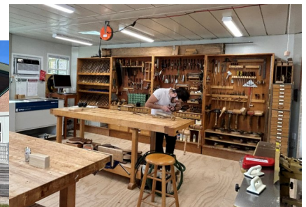
Photos of the temporary Student Woodshop