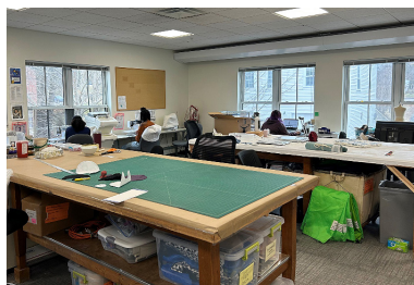
Costume Shop employees are thrilled with their temporary space in Sudikoff, space they call "the Tree House."