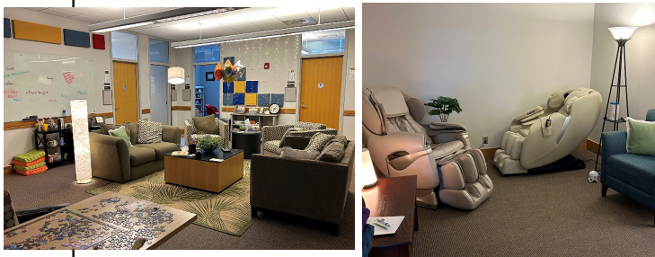
The new student wellness space includes a tranquility room, kitchen, and relaxing activities.

A portion of this space—which served as swing space for the French and Italian departments during Dartmouth Hall renovations—recently opened to allow the Student Wellness and Academic Support offices to move in. These, combined with the Undergraduate Deans and Accessibility Offices, provide one-stop-shop space for undergraduate students.