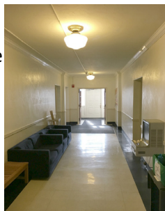
Hallways before and after renovations.

An 11-month project to upgrade the infrastructure and finishes at Reed Hall is nearly complete. Project Manager Lindsay Walkinshaw commented, "Some of the biggest challenges were to integrate modern utilities into an historic building and make it look like they were always there or make them as inconspicuous as possible. Threading an elevator through wooden trusses that are nearly 200 years old is really cool. It's really satisfying to hand over a building knowing that all the work we did will positively impact the environment in which our students learn and our faculty work. The coordination with so many groups in FO&M, such as our shops, work control and engineering, was very much appreciated."